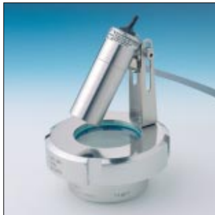
Lighting port assembly, showing Lumiglas Mini Luminaire Stainless Steel, Model USL01, with hinged bracket fitted to screwed sightglass (MV 50).