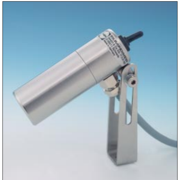
Lumiglas Mini-Luminaire Stainless Steel, Model USL01 with hinged bracket.