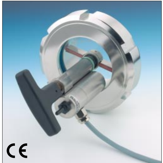
Lumiglas Mini-Luminaire Stainless Steel, Model USL01 with mounting clamp fitted on a screwed sightglass fitting with Lumiglas sightglass wiper type SW I.

The clip on mounting clamp for the Lumiglas-wiper assembly (type SW I) is included in the supply as standard. If the option of hinged bracket is required, it should be ordered separately.