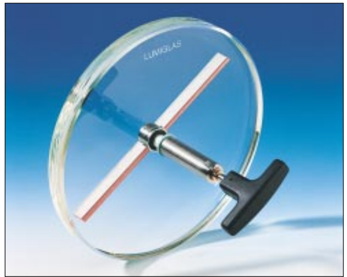
Sightglass Wiper type SW I built into sightglass disc

If the wiper is ordered separately, i.e. not installed into sightglass disc by the manufacturer, the assembly has to be done with regard to separate installation an operating instructions, attached to the delivery.