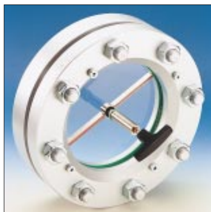
Lumiglas Wiper SW I, fitted into sightglass assembly DIN 28120