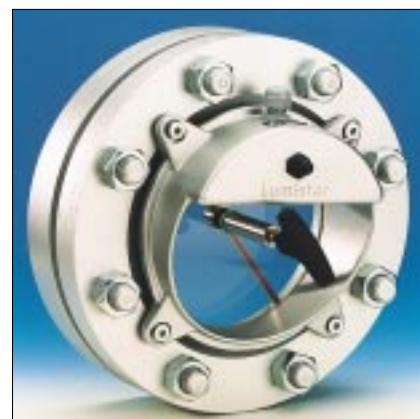
Lumiglas Wiper SW I, as shown adjoining but with Lumistar luminaire fitted.